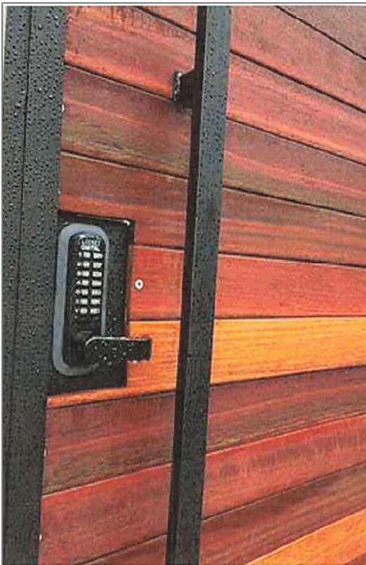
This lock or equivalent