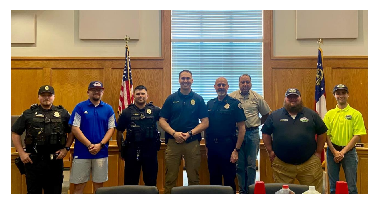
Attended Whataburger Public Safety Recognition gathering