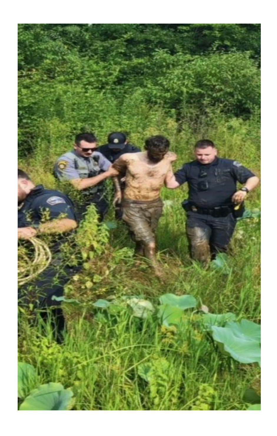
Officers assisting LCSO apprehend wanted suspect after foot chase