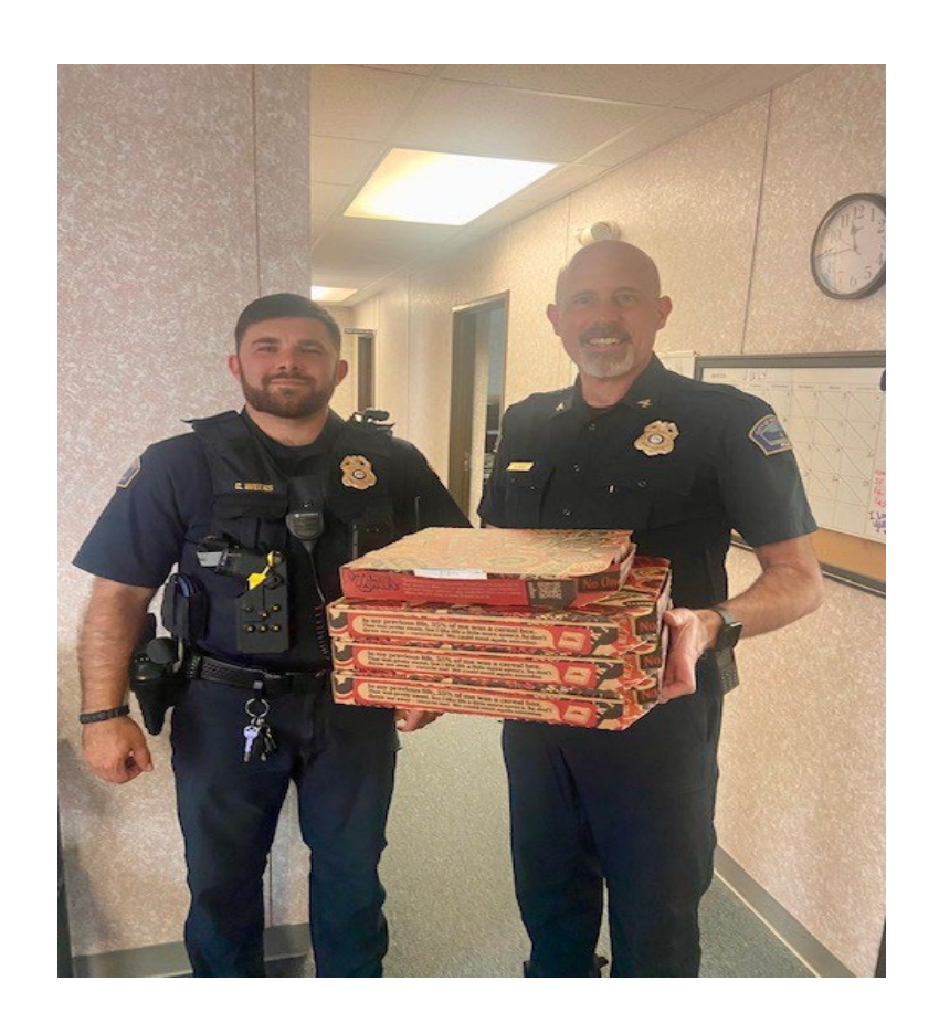
Lunch provided by Anderson-Underwood Funeral Home