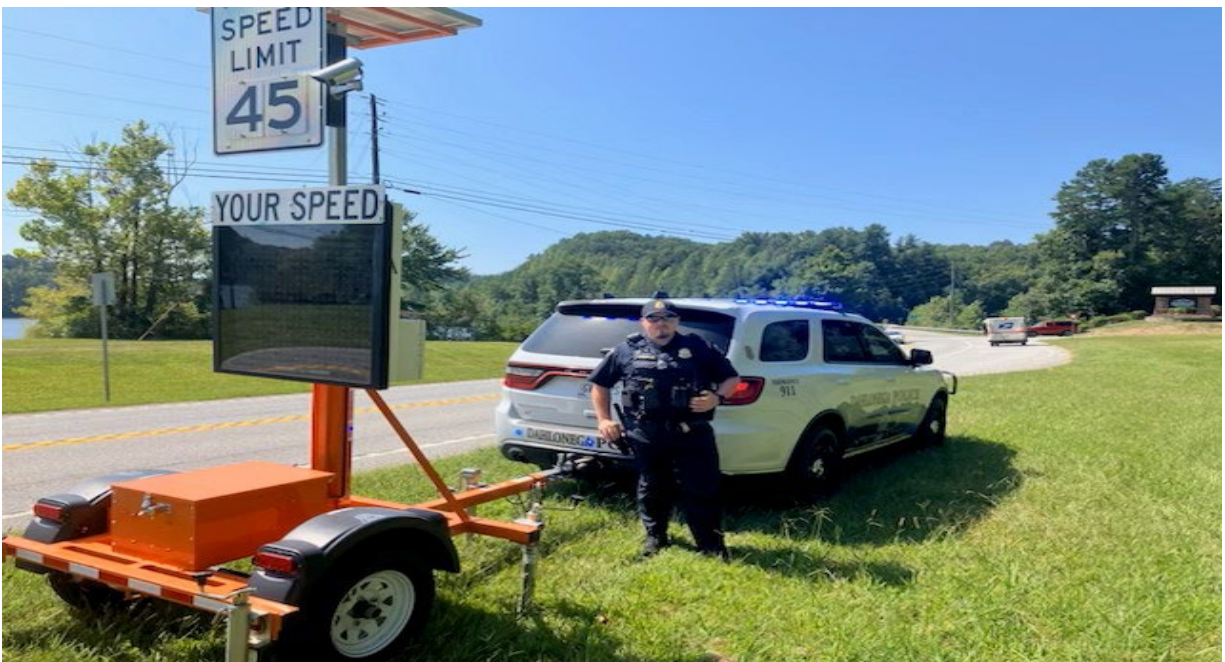
Officers continue to deploy RADAR Speed trailer in the community