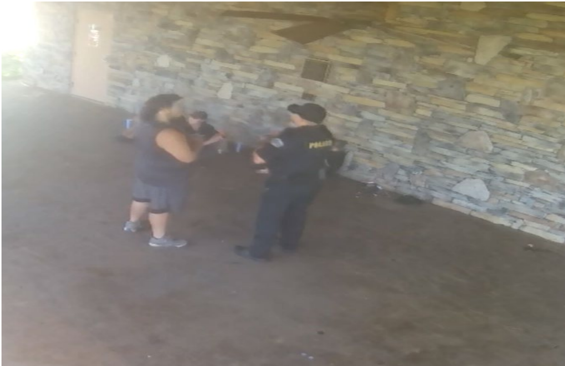
Officers continue to proactively educate people on new urban camping ordinance