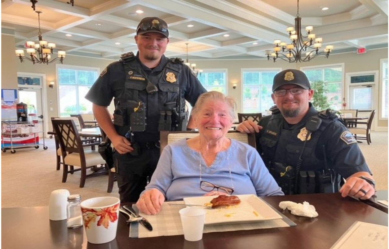
Officers attended monthly coffee and breakfast gatherings at Dahlonega Care